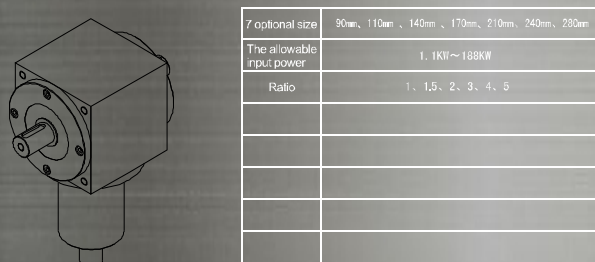
VS series reducer (VS09 VS11 VS14 VS17 VS21 VS24 VS28)